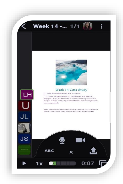
Figure 2 Screenshot of Course Implementation

At the beginning of the course, students' English oral communication skills were thoroughly evaluated by a Business English instructor. Their speaking abilities were classified on a scale from 1 to 3, with 1 indicating low proficiency, 2 representing average proficiency, and 3 indicating high proficiency. The initial assessment determined each participant's skill levels and subsequent systematic pairings each week promoted varied competencies within each group. Post-discussions, participants uploaded audio or video files of the sessions to VT using their mobile devices. They enjoyed the flexibility of deciding how to approach weekly assignments and the opportunity to practice more by creating and potentially discarding multiple attempts at each task. Final submissions, in either a video or audio format, were uploaded for evaluation and feedback by both peers and the instructor. If students missed an in-class activity deadline, they were given an extended window of a week to complete their activity. This encouraged persistent participation by enabling students to refine their response before the final submission.