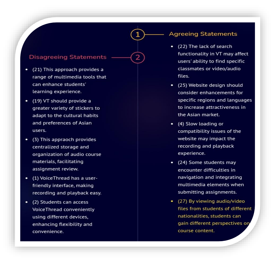
Figure 5 Distinctive statements of Factor 1b