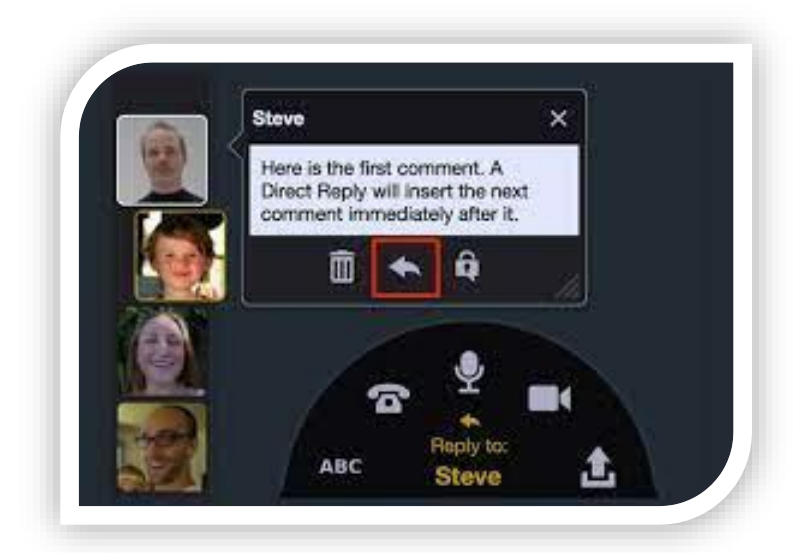
Figure 1 Functions of VoiceThread (https://voicethread.com/)

The implementation of VT in classrooms has been shown to be linked to students' higher engagement and satisfaction by fostering active participation and cultivating learning communities where students can engage collaboratively with course materials (Brunvand & Byrd, 2011; Ching & Hsu, 2013). Moreover, the platform helps to enhance self-directed learning abilities and presentation skills, as well as providing an avenue for teachers to offer personalized audio feedback, which further enhances students' understanding of the course content (Delmas, 2017; Fox, 2017). However, it has also been observed that VT usage can increase students' workload due to the need of thorough preparation before posting, and that it may potentially cause discomfort for some students when sharing oral content, which tends of have a negative effect on their linguistic confidence (Fredricks, Tierney, Bodek, & Fredricks, 2016).