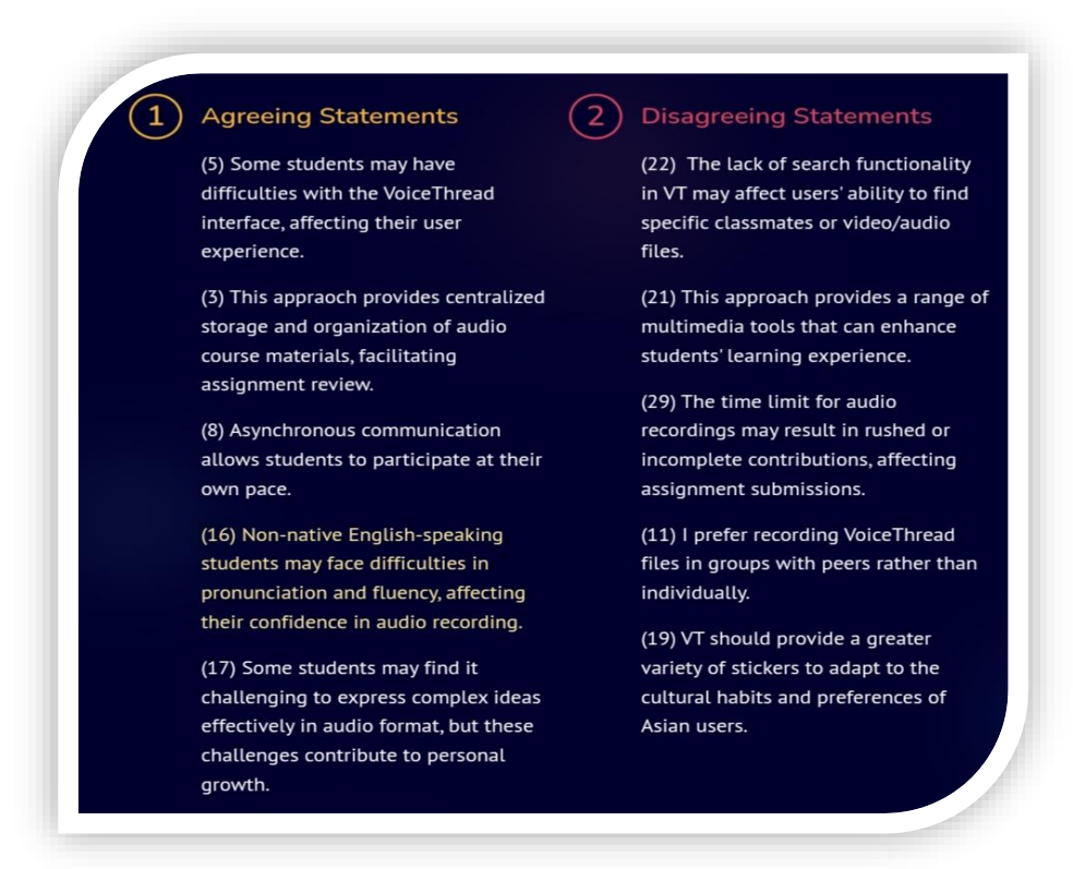
Figure 6 Distinctive statements of Factor 2

The results of the analysis of the students' perception of utilizing VoiceThread within EMI contexts underscored critical aspects in relation to interaction, interface, and functionality. It appeared that the students had a positive attitude toward the platform's potential to amplify engagement and foster collaborative learning experiences. Conversely, they were notably apprehensive about the platform's usability and the prevalence of technical glitches. These findings constitute invaluable insights that steer the trajectory for educators and developers to refine and optimize VoiceThread's applications in educational settings.