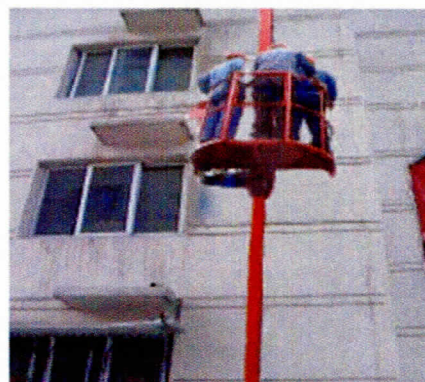
Fig3: Outdoor Elevator

The 13 th reverse principle, before, elevator evacuation is the escape method which is abandoned by people. However, the emergency of outdoor elevator means that the elevator will become a kind of effective escape method. This emergency elevating facility can shuttle among all floors and ground of high buildings at the key time of high building fire. If at the initial stage of fire, the fire fighters can rapidly reach the fire source floor through the emergency elevating facility to control the fire in a certain scope. In case that the fire has spread, this facility also can put out the fire and rescue. Guide rail, elevating facility and the evacuation passageway window constitute a temporary emergency passageway which is connected with the ground (see Fig. 3).